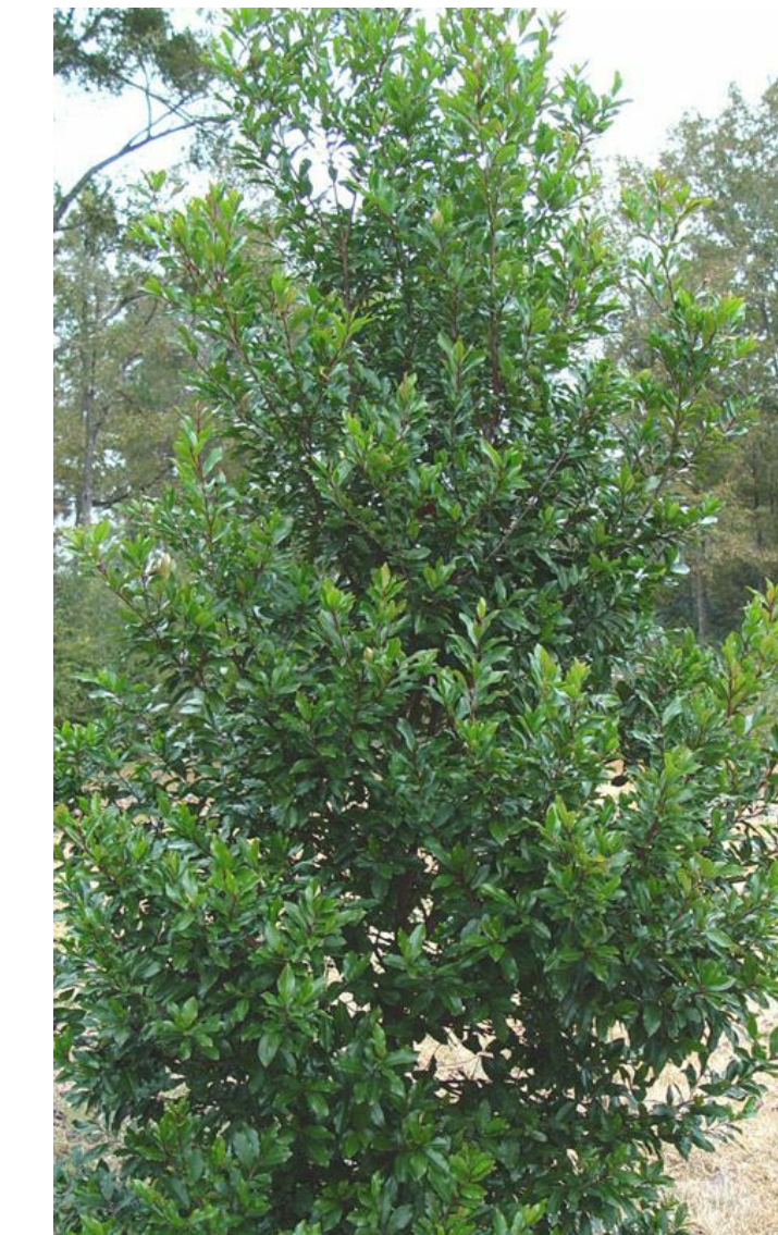
CHERRY LAUREL SAMPLE PHOTO

NOTE: PROPOSED PLANTING SHALL BE CHERRY LAUREL OR OTHER REASONABLY COMPARABLE SPECIES, IF AT TIME OF CONSTRUCTION, THE PROPOSED VARIETY IS NOT AVAILABLE OR CANNOT BE REASONABLY PLANTED IN THE PROPERTY'S SLOPING TERRAIN.