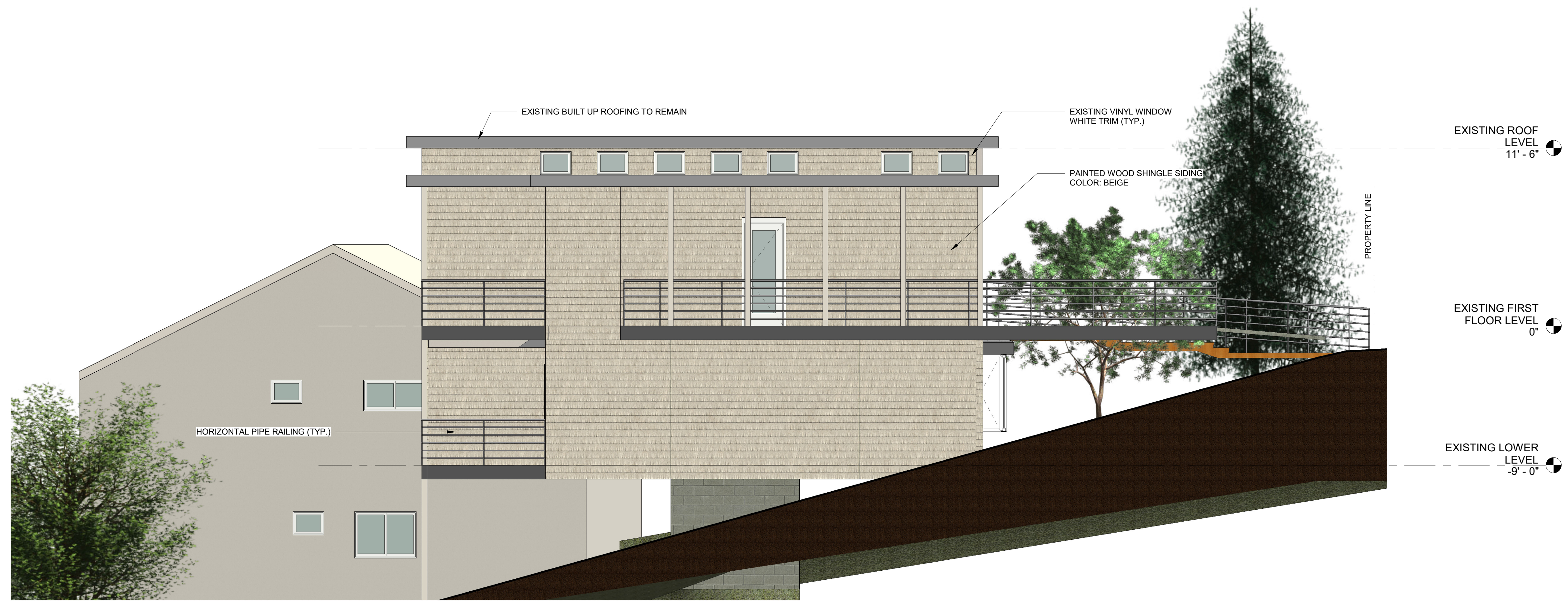
① EXISTING LEFT SIDE ELEVATION 1/4" = 1'-0"