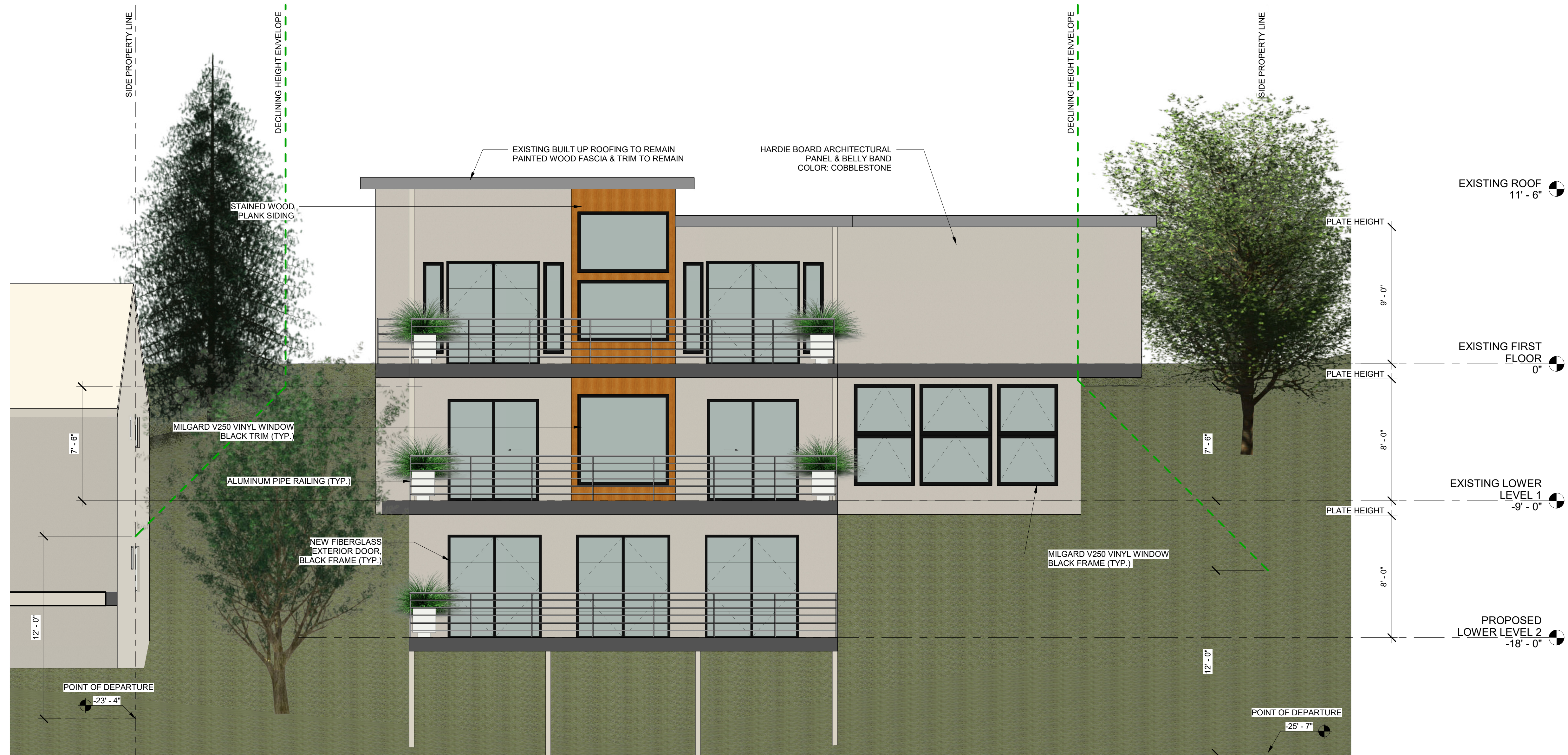
2 PROPOSED REAR ELEVATION 1/4" = 1'-0"