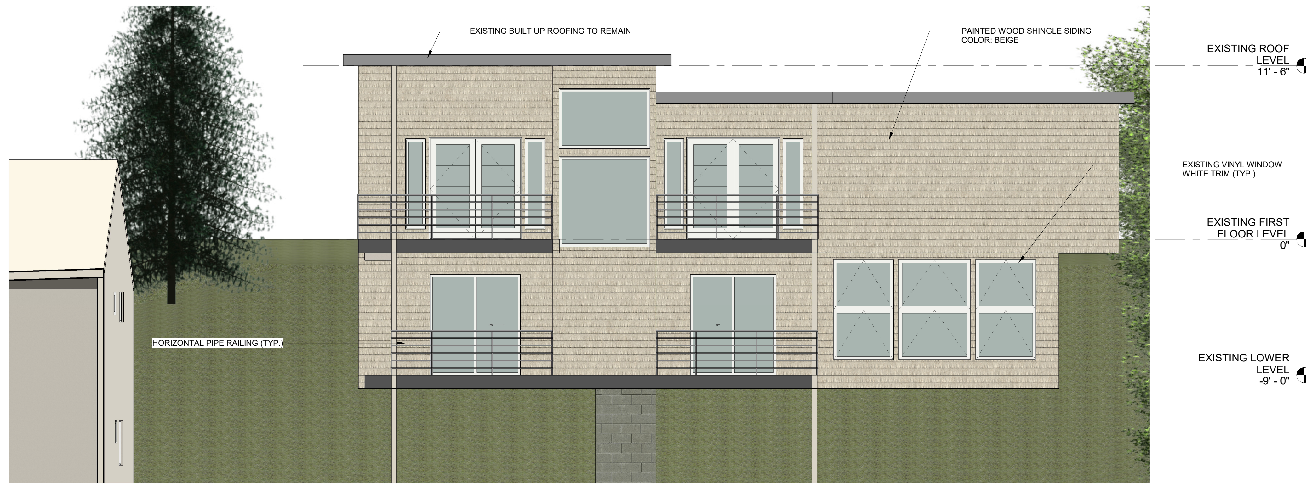
1 EXISTING REAR ELEVATION 1/4" = 1'-0"