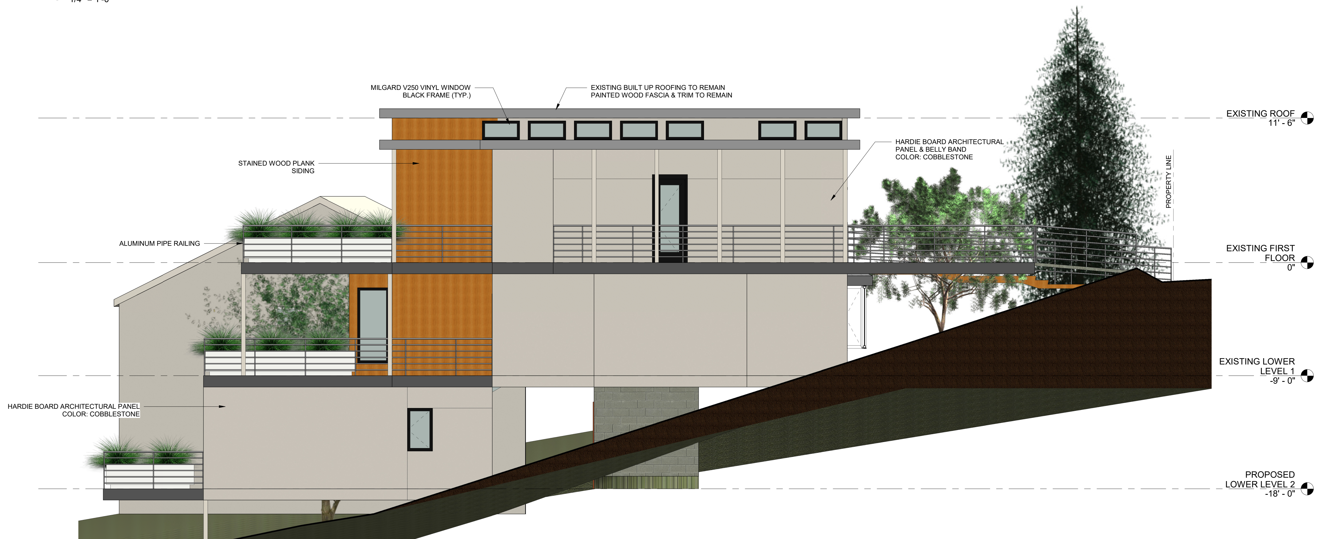
② PROPOSED LEFT SIDE ELEVATION 1/4" = 1'-0"