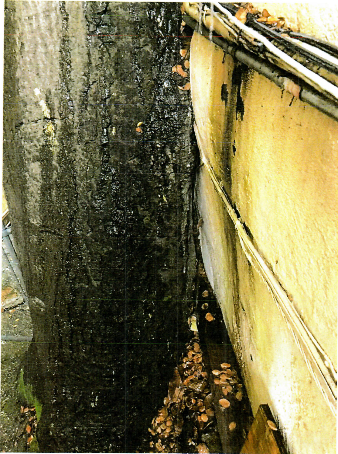
Garage wall and lower trunk of tree