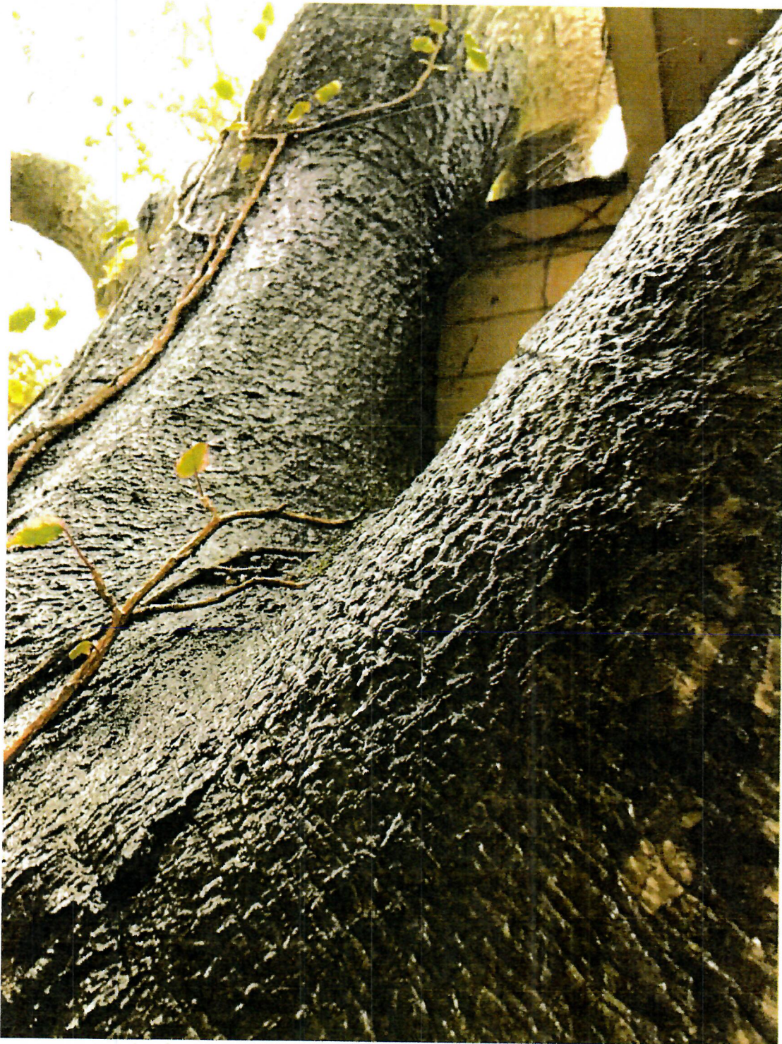
Large scaffold limbs of tree touching the house