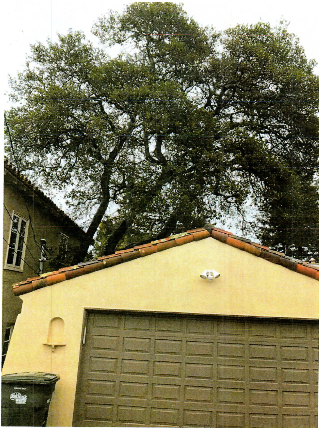
Canopy over the house