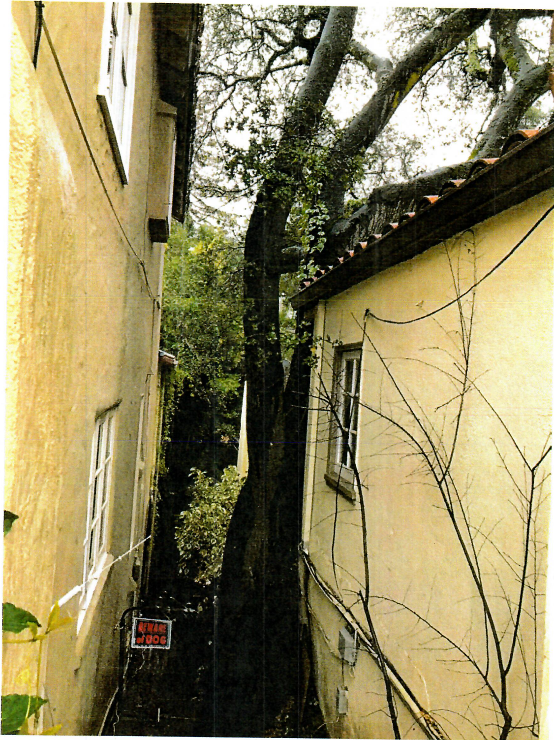
Coast live oak between houses