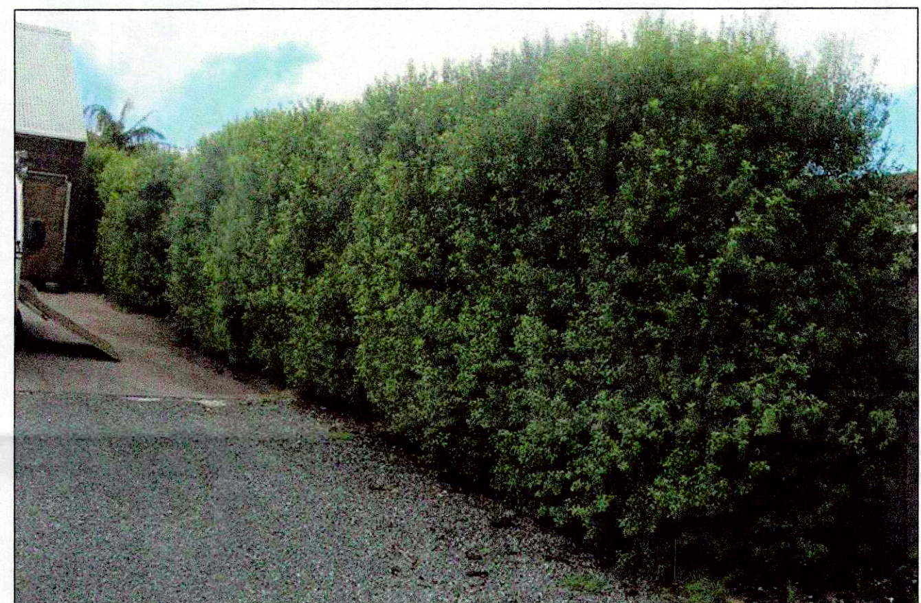
PT - Pittosporum tenuifolium(Shrub-form)