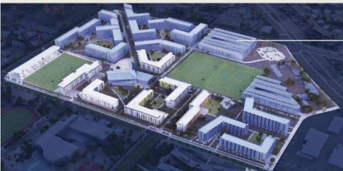
UC Riverside Dundee Residence Hall, Developer ACC