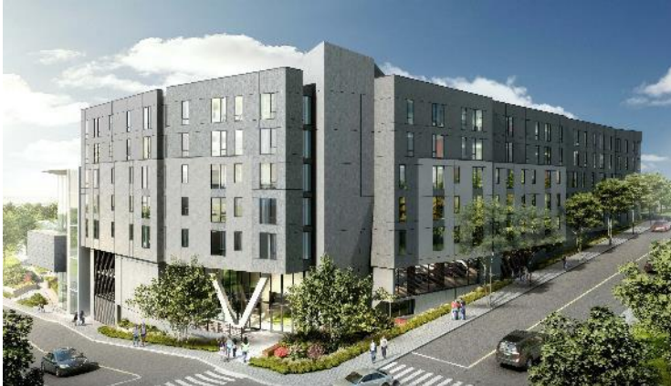
Goldman School of Public Policy + Housing