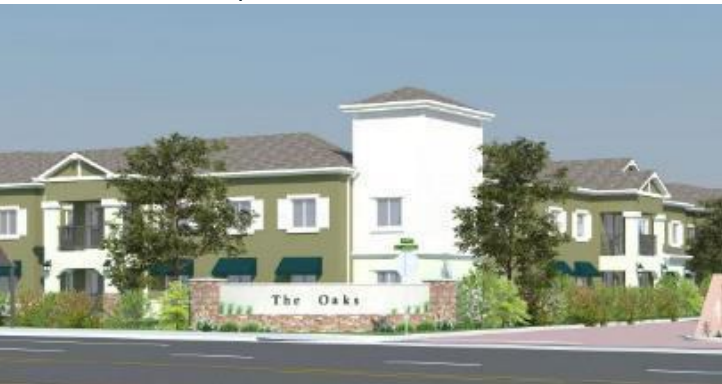
Atascadero, Corporation for Better Housing