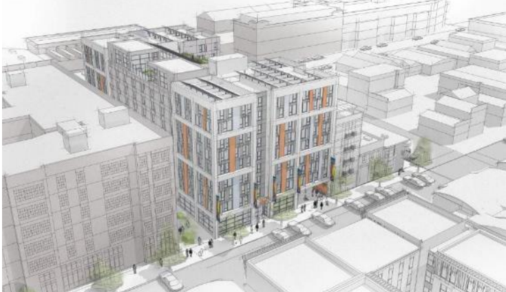
681 Florida, San Francisco