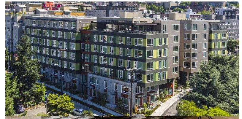
August Apartments, Seattle