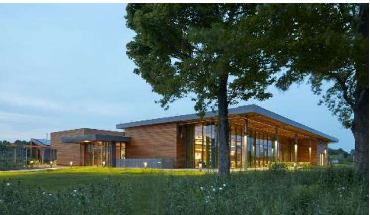
Chatam University Dining Commons