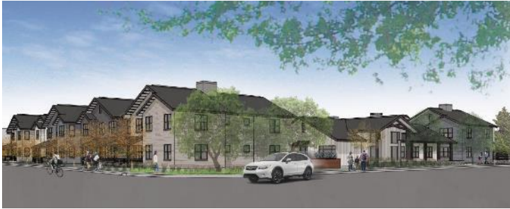
Altamira Family Apartments, Sonoma