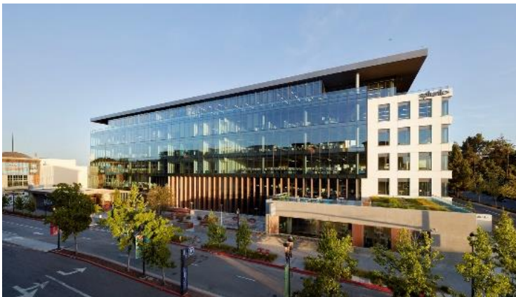
Santana Row Lot 11