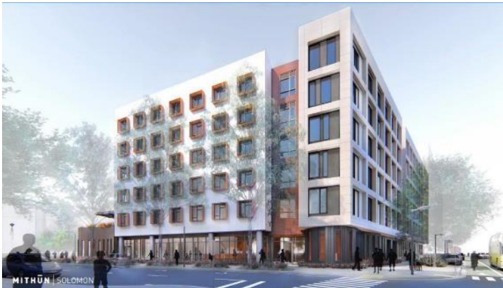
Maceo May Veterans Apartments, Treasure Island