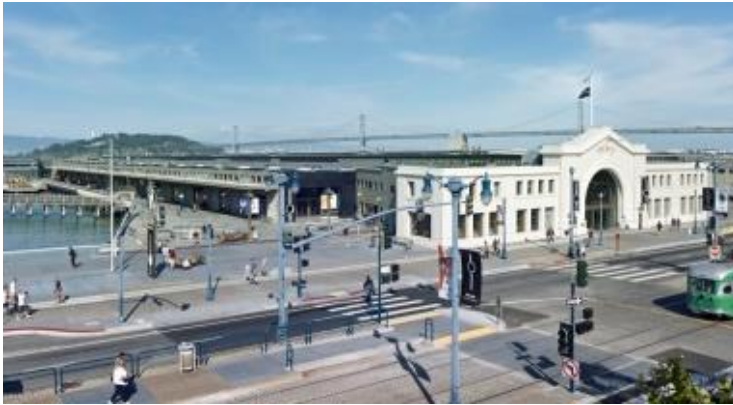
Exploratorium, San Francisco