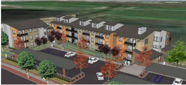
Stoddard Housing, Napa