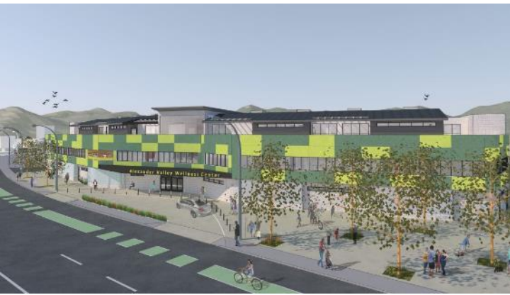
Alexander Valley Medical Center