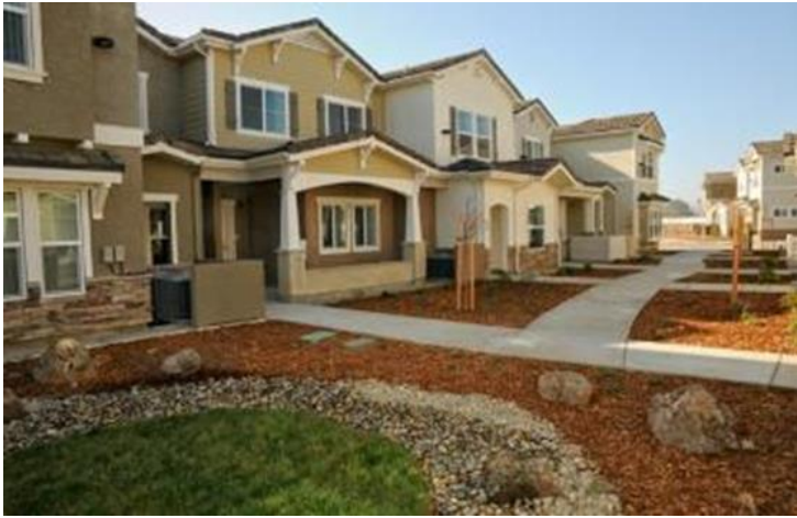
Valley Glen, Dixon