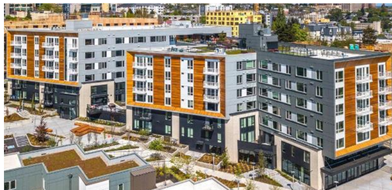
Batik Apartments, Seattle