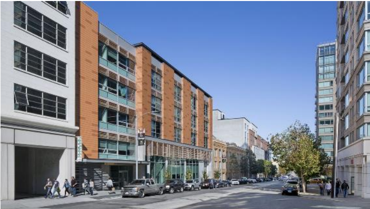
270 Brannan, San Francisco