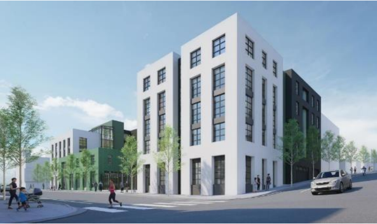
Hunters Point Shipyard Block 54, San Francisco