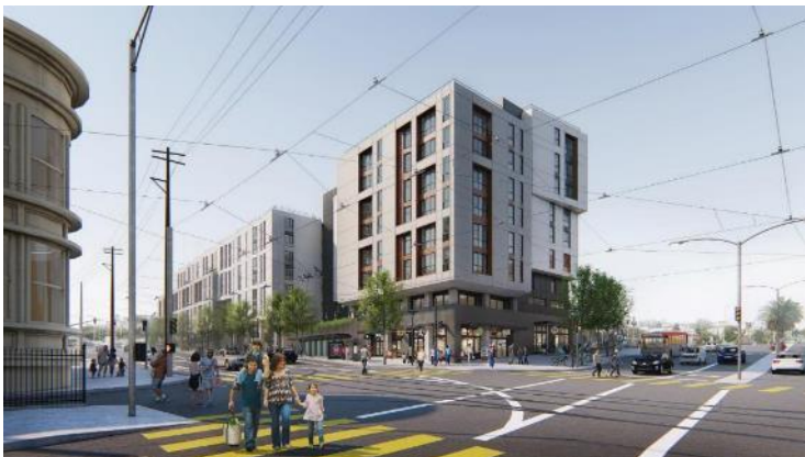
Balboa Upper Yard Family Apts, San Francisco