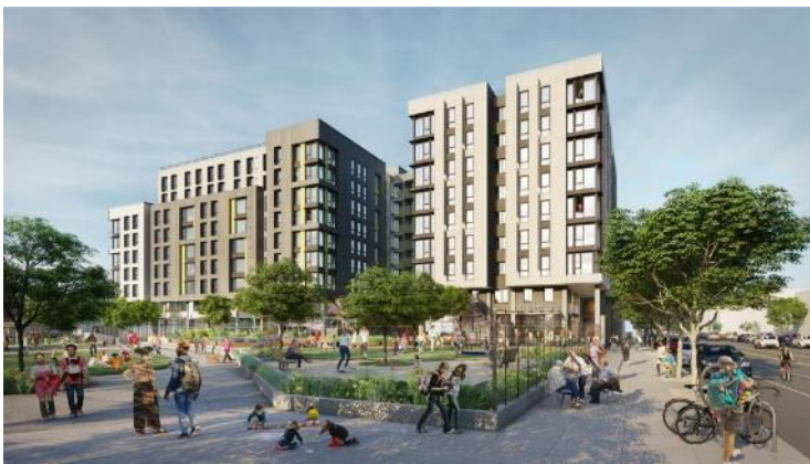
Casa Adelante, 2060 Folsom, San Francisco