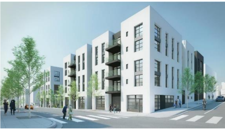
Hunters Point Shipyard Block 52, San Francisco