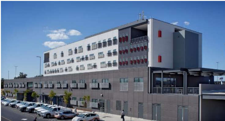
SMUD Office & Operations Building, Sacramento