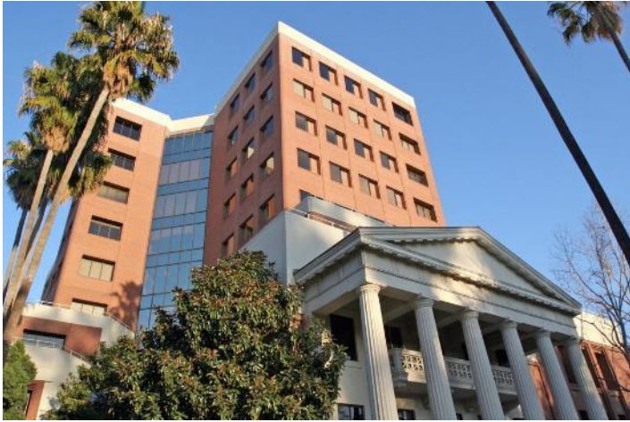
152 N. 3 rd , San Jose