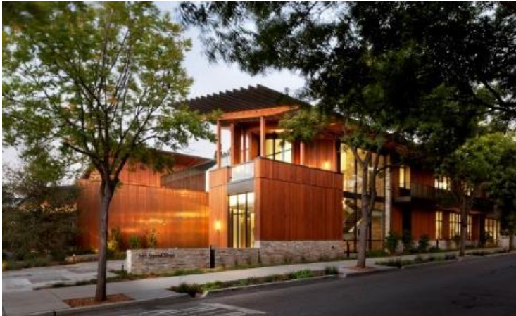
Packard Foundation, Los Altos