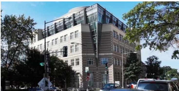
American Geophysical Union