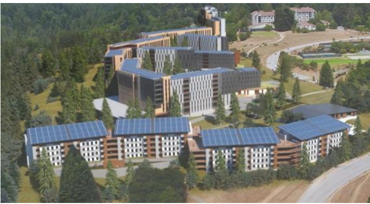
UC Santa Cruz Student Housing West