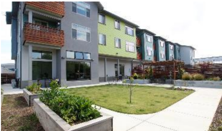
Plaza Point, Arcata