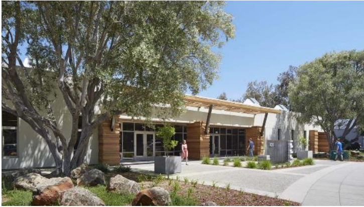
435 Indio, Sunnyvale