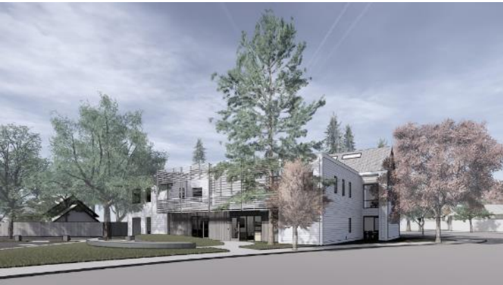
Sonoma Clean Power