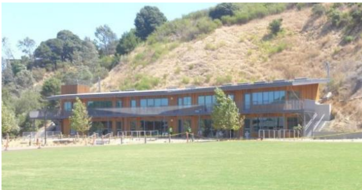
Marin Country Day School, Corte Madera