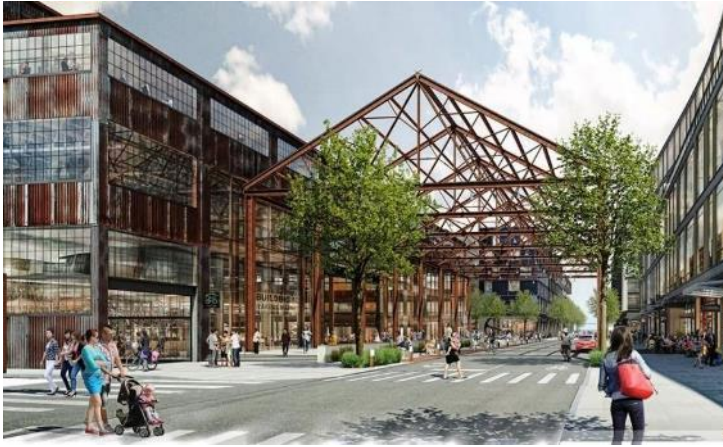
Pier 70, Building 12