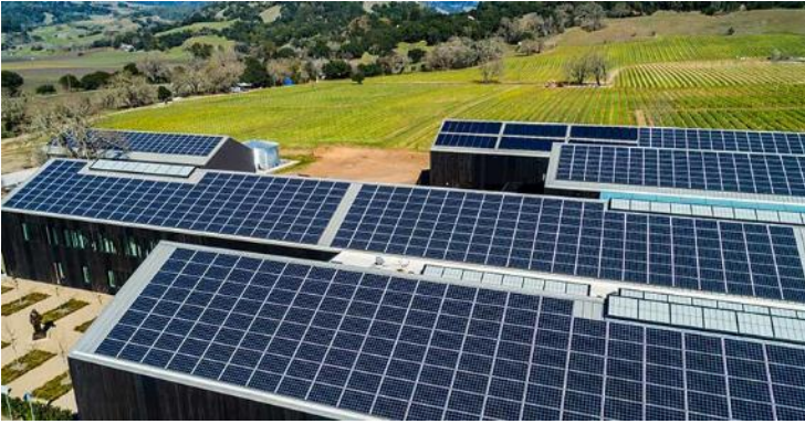
Silver Oak Winery