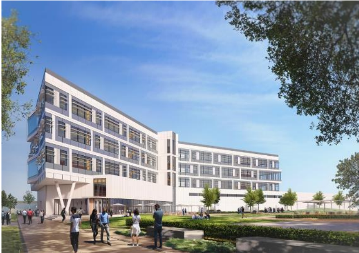
SFO Consolidated Admin Facility