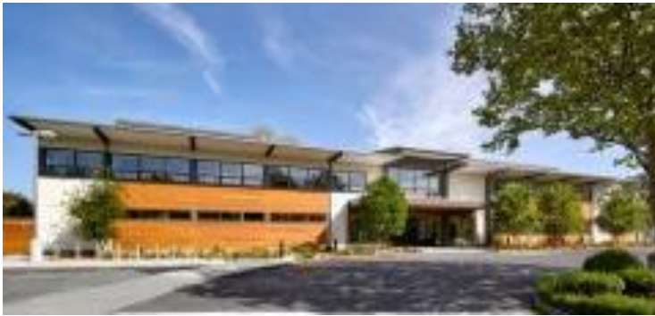
Mark Day School, San Rafael