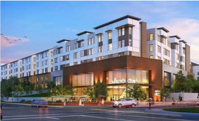
UC Irvine Student Housing West, Developer ACC