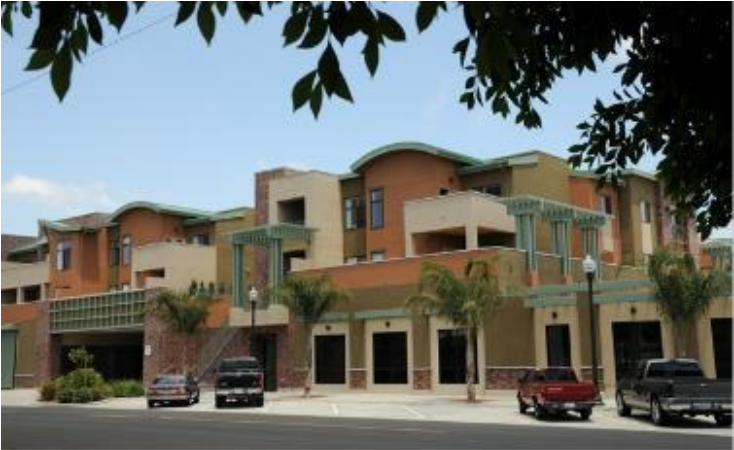
Colonial House Apartments, Oxnard