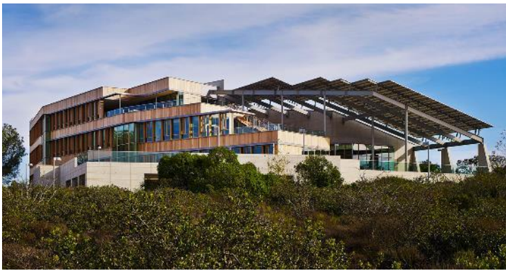
J. Craig Venter Institute Lab, San Diego