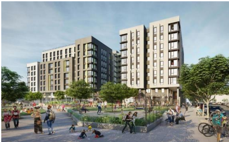
Casa Adelante, San Francisco