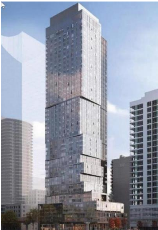
Cascade Apartments, Seattle