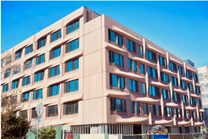
The Tidelands Housing, San Francisco