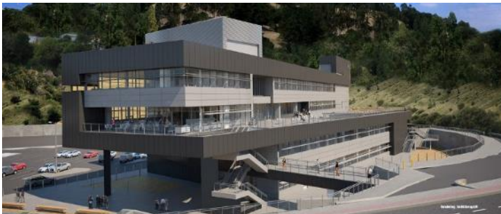
Integrated Genomics Lab, LBNL