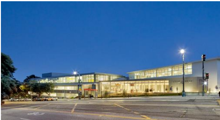
Lick Wilmerding High School, San Francisco