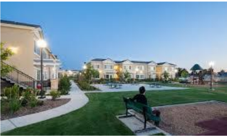
Cloverdale, Corporation for Better Housing