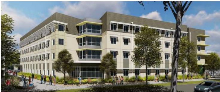
UC Davis Webster Hall Replacement