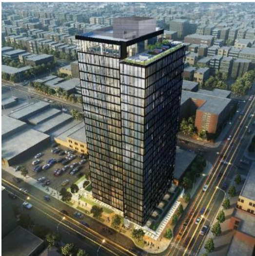
4700 Brooklyn Ave NE, Seattle