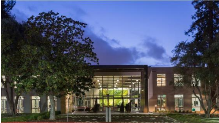
415 Mathilda, Sunnyvale