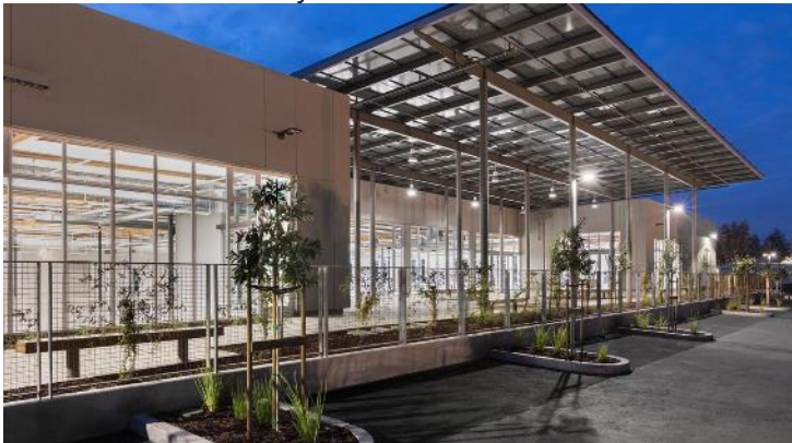
380 N. Pastoria, Mountain View