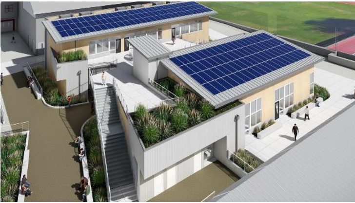
Albany High School