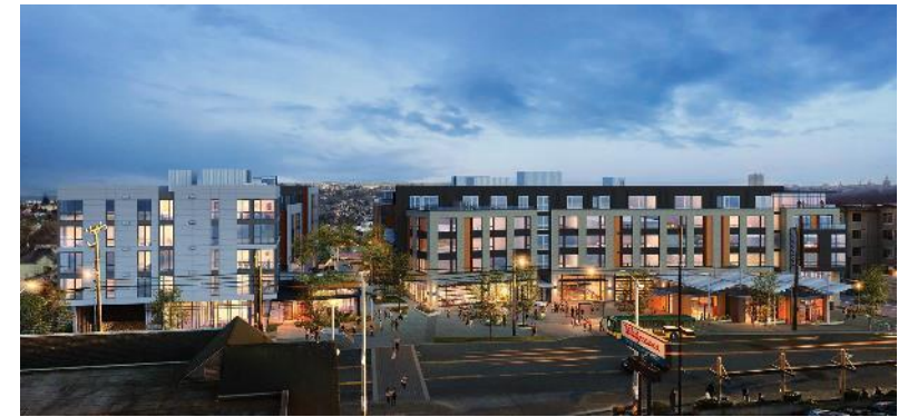
Jackson Apartments, Seattle