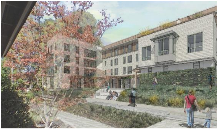
Coliseum Place, Oakland