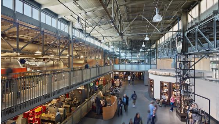
The Exploratorium, San Francisco