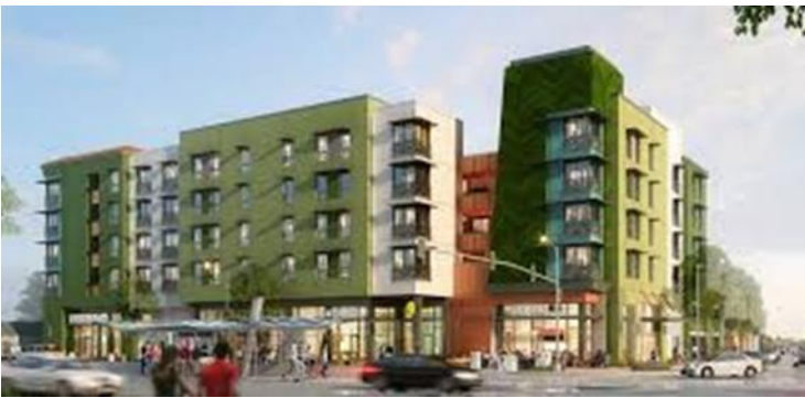
Quetzal Gardens, San Jose