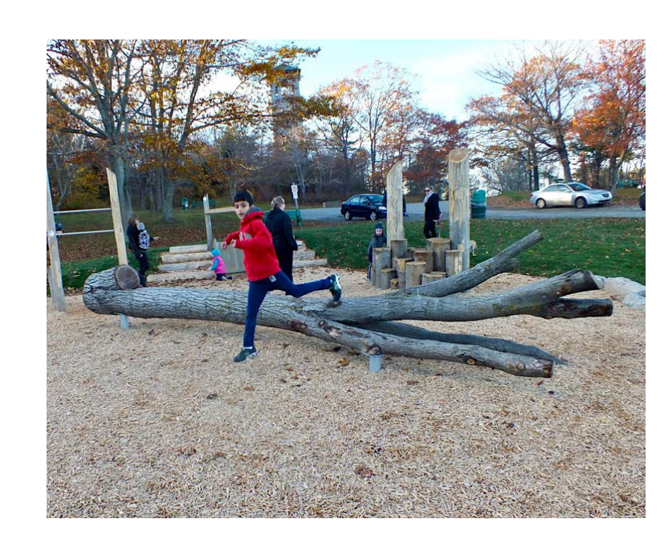
4. LOG BALANCE BEAM