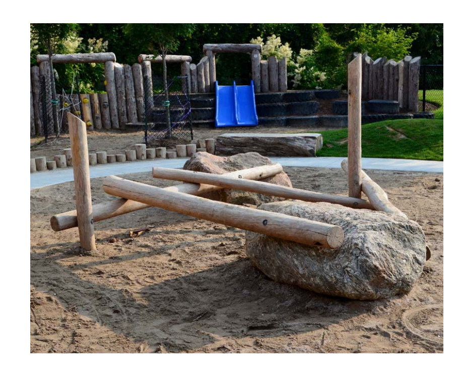
6. "LOG JAM" ON BOULDERS