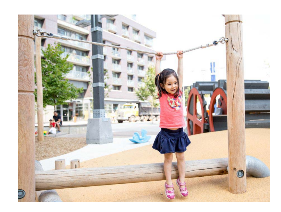
1. LOG AND ROPE CLIMBER/SWING