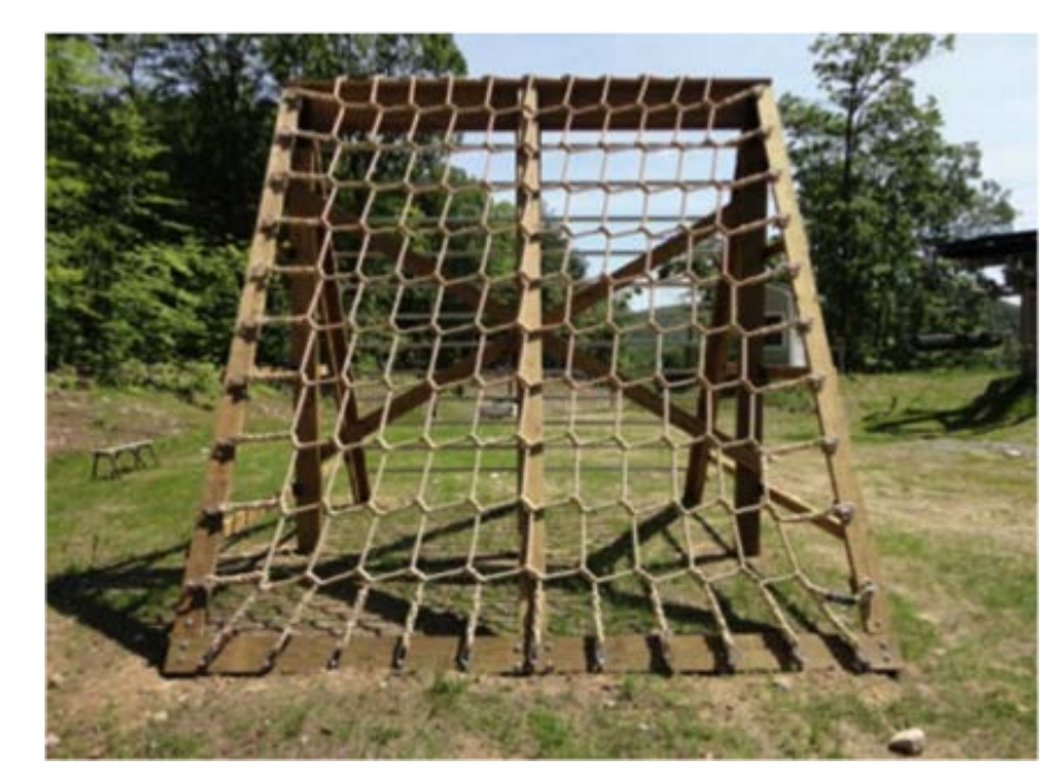
2. CARGO NET