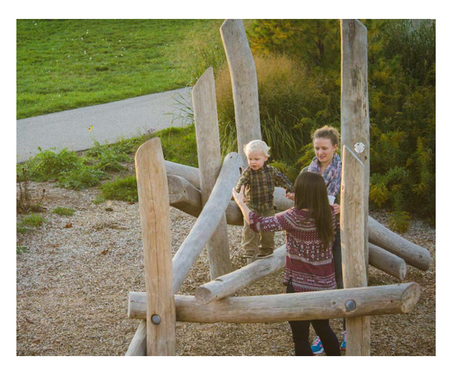
3. "LOG JAM"