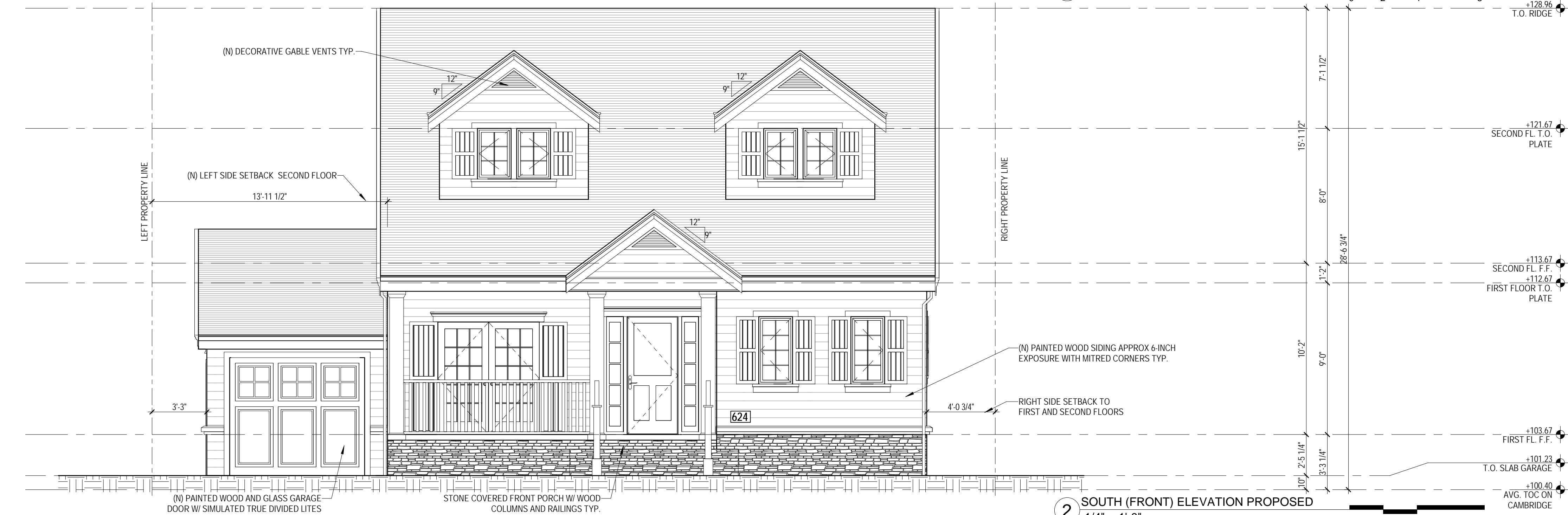
2 SOUTH (FRONT) ELEVATION PROPOSED 1/4" = 1'-0"