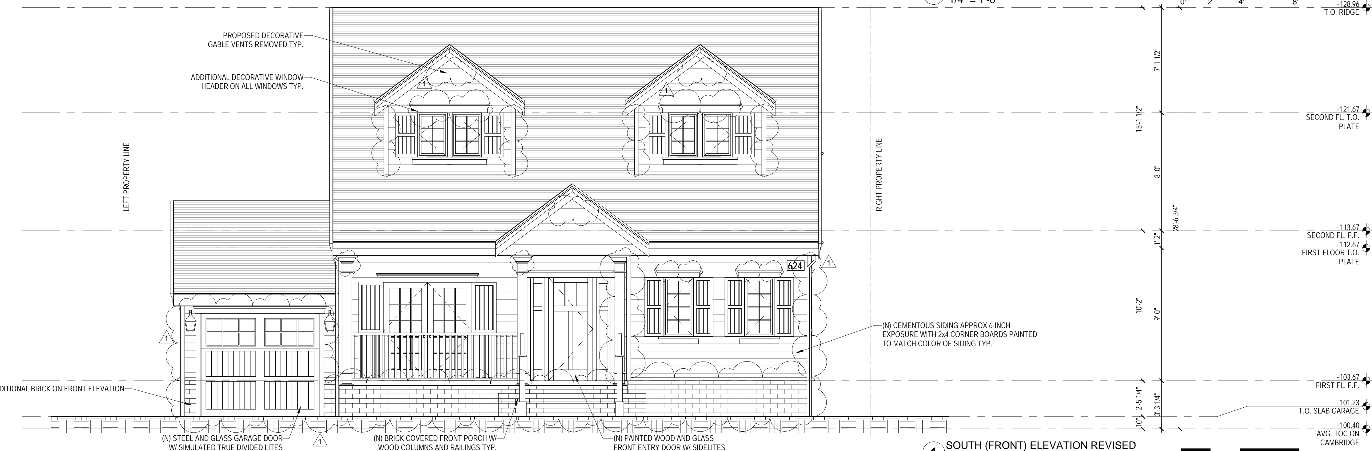
1 SOUTH (FRONT) ELEVATION REVISED 1/4" = 1'-0"