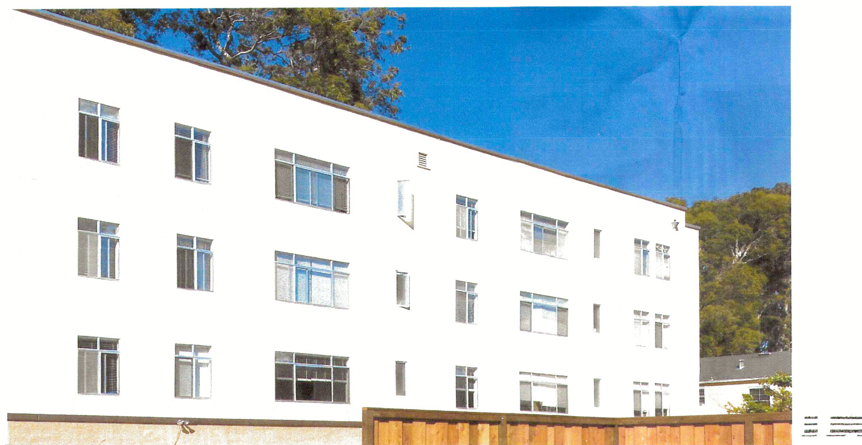
VIEW FROM TOP OF FENCE FROM DINING ROOM