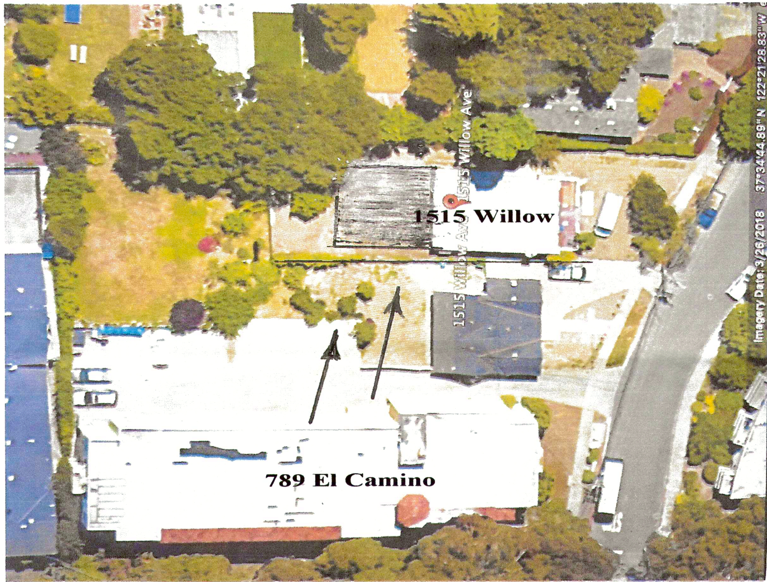
VIEW FROM ABOVE SHOWING LINE OF SIGHT FROM APARTMENT BUILDING AT 789 EL CAMINO INTO RESIDENCE AT 1515 WILLOW.