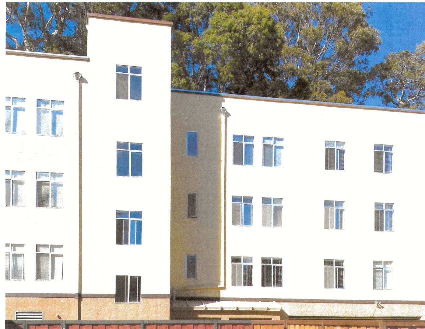
VIEW FROM TOP OF FENCE FROM KITCHEN WINDOW