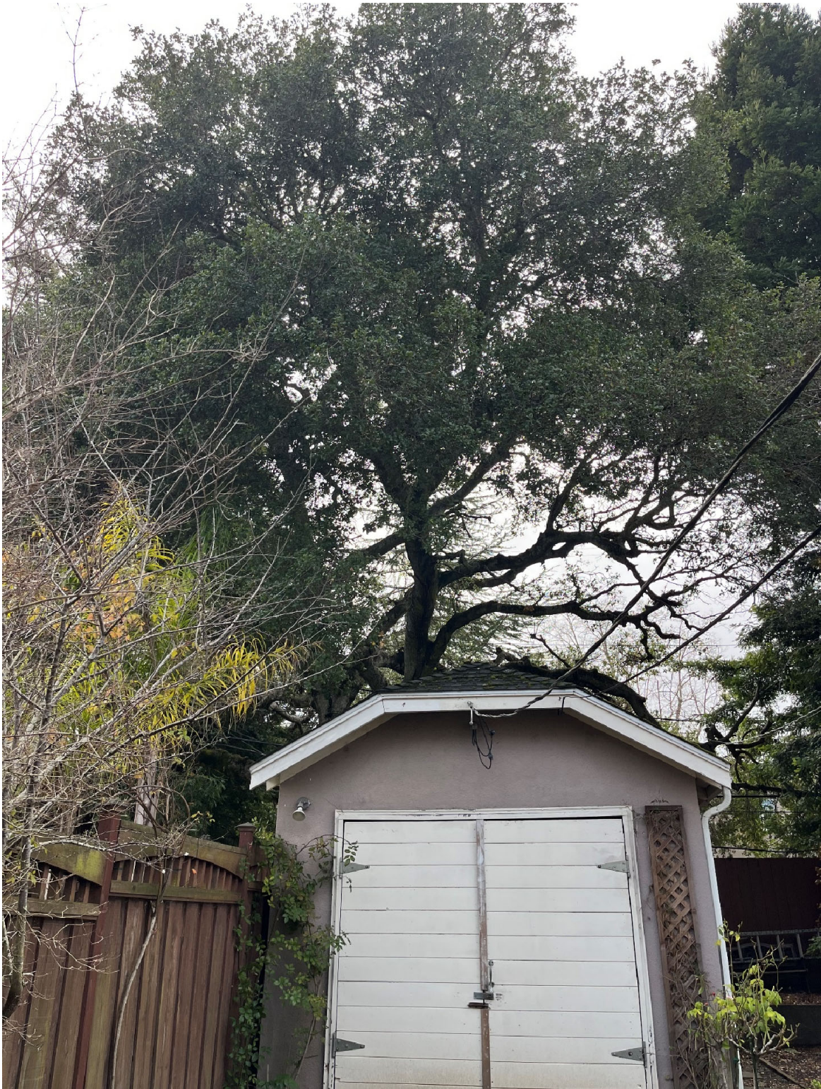
Tree # 5