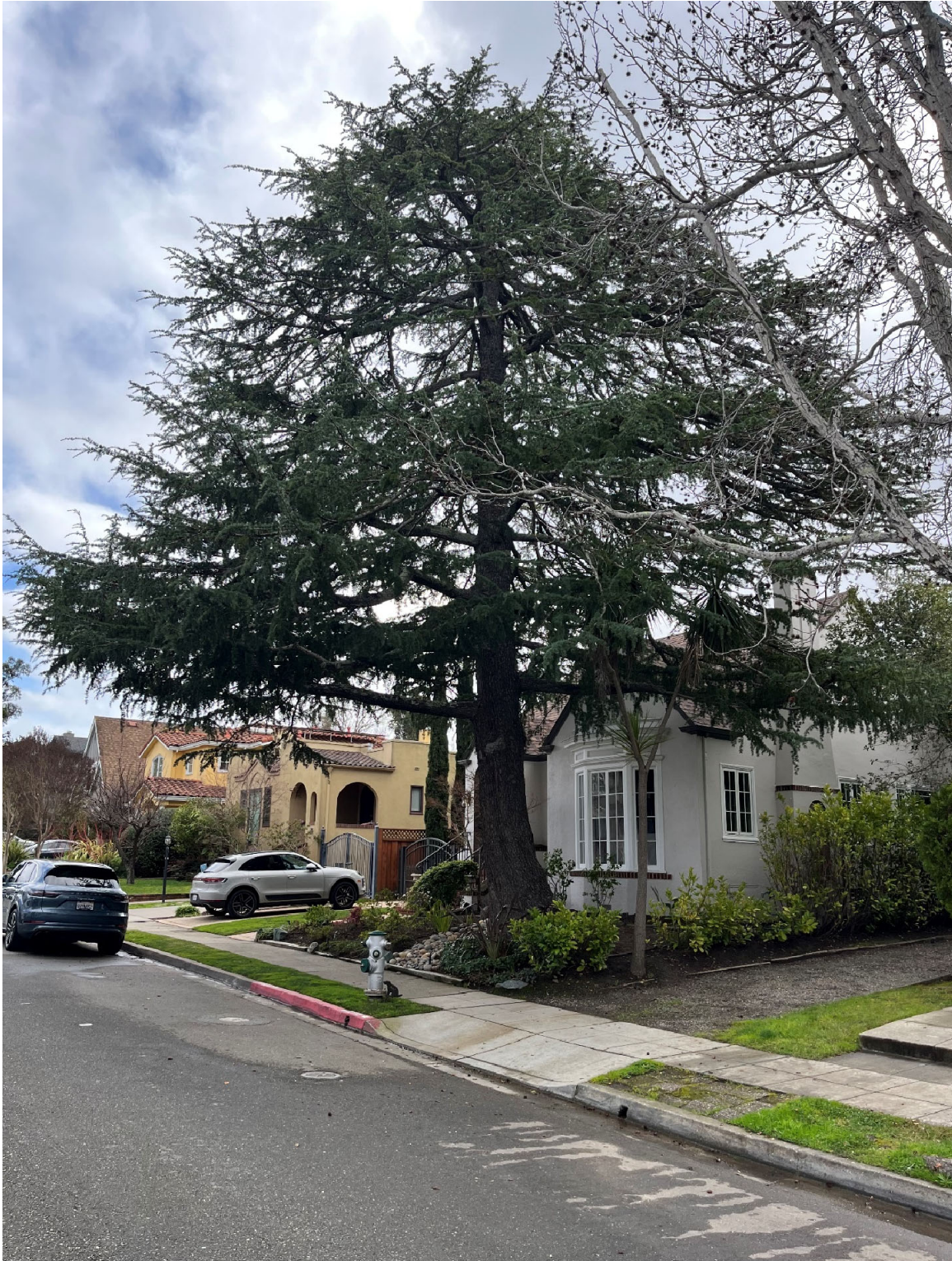
Tree # 3