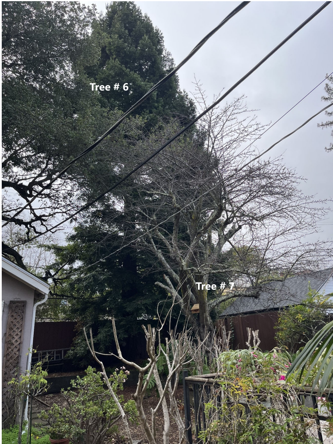
Tree #s 6 and 7