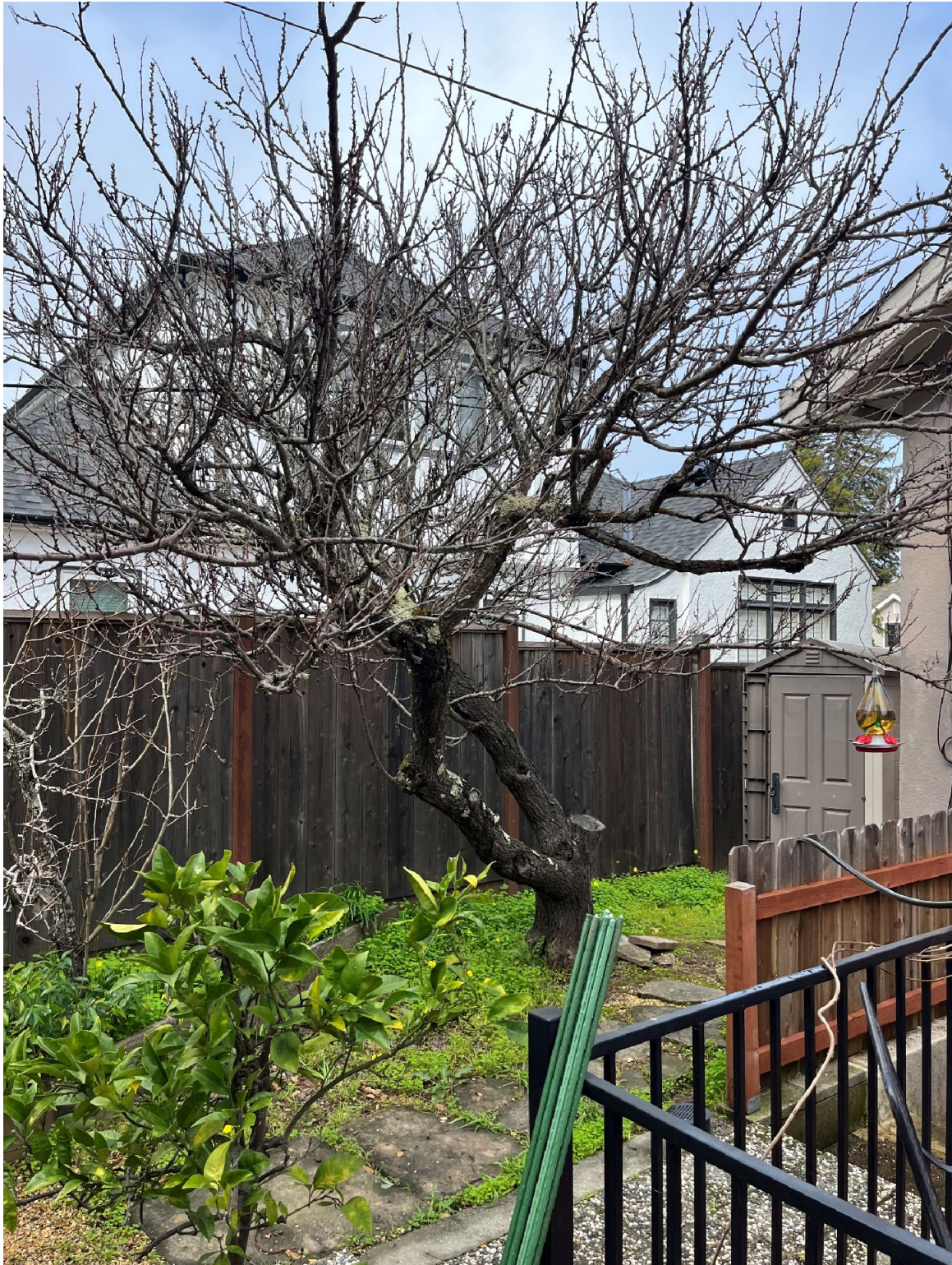
Tree # 8