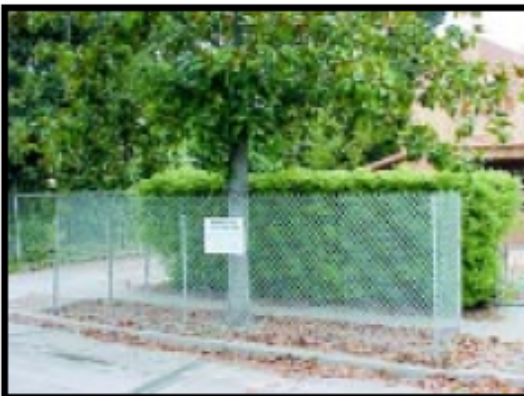
IMAGE 2.15-3 Tree Protection within a Planter Strip

A new sidewalk is proposed which will involve demolition of existing sidewalk and curb and gutter. Arborist should be present at pre-construction meeting with Public Works.