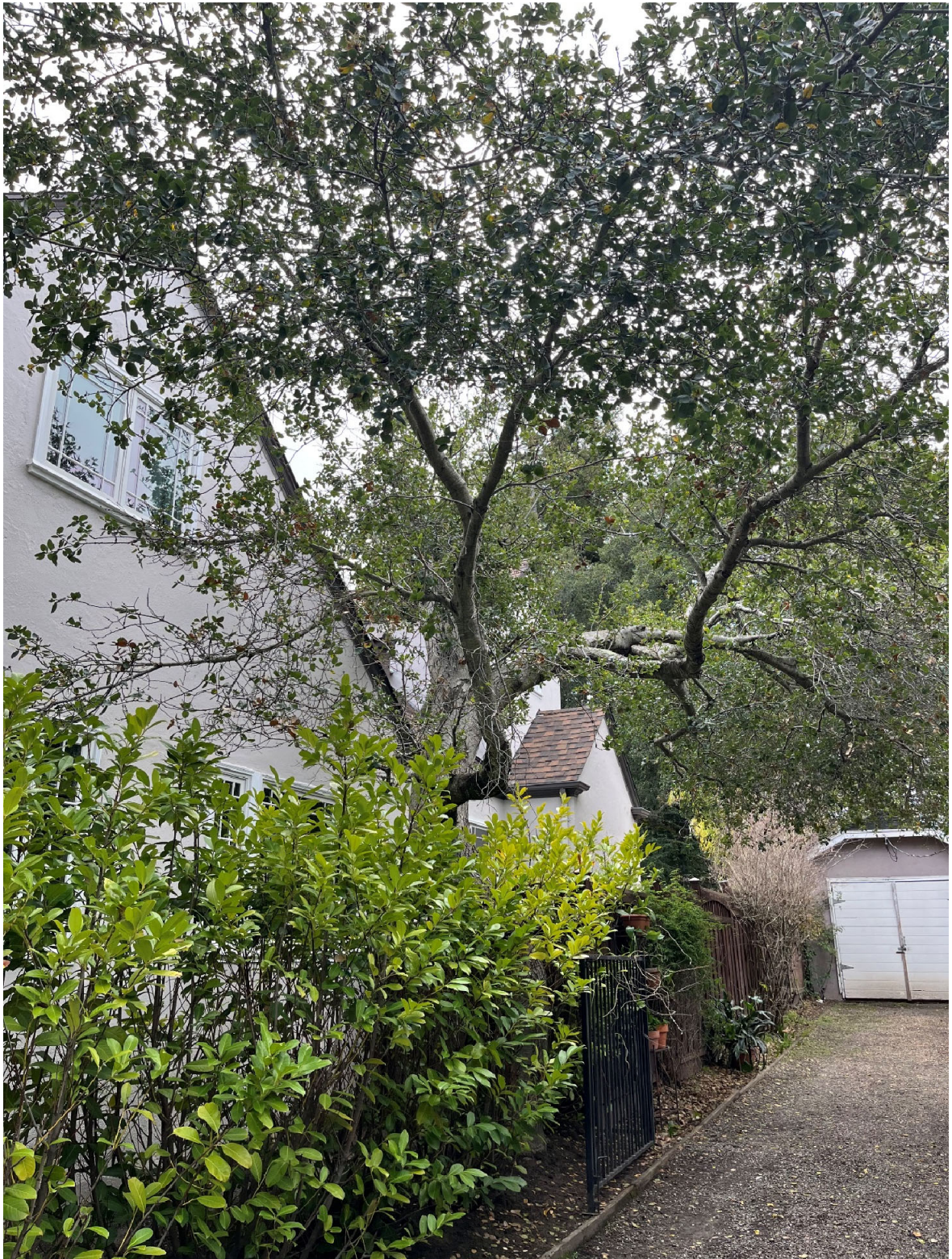
Tree # 4