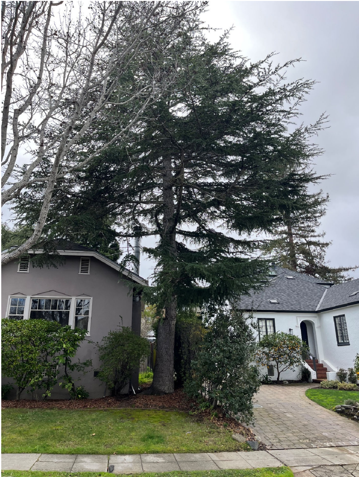
Tree # 2