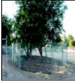
IMAGE 2.15-1 Tree Protection Fence at the Dripline