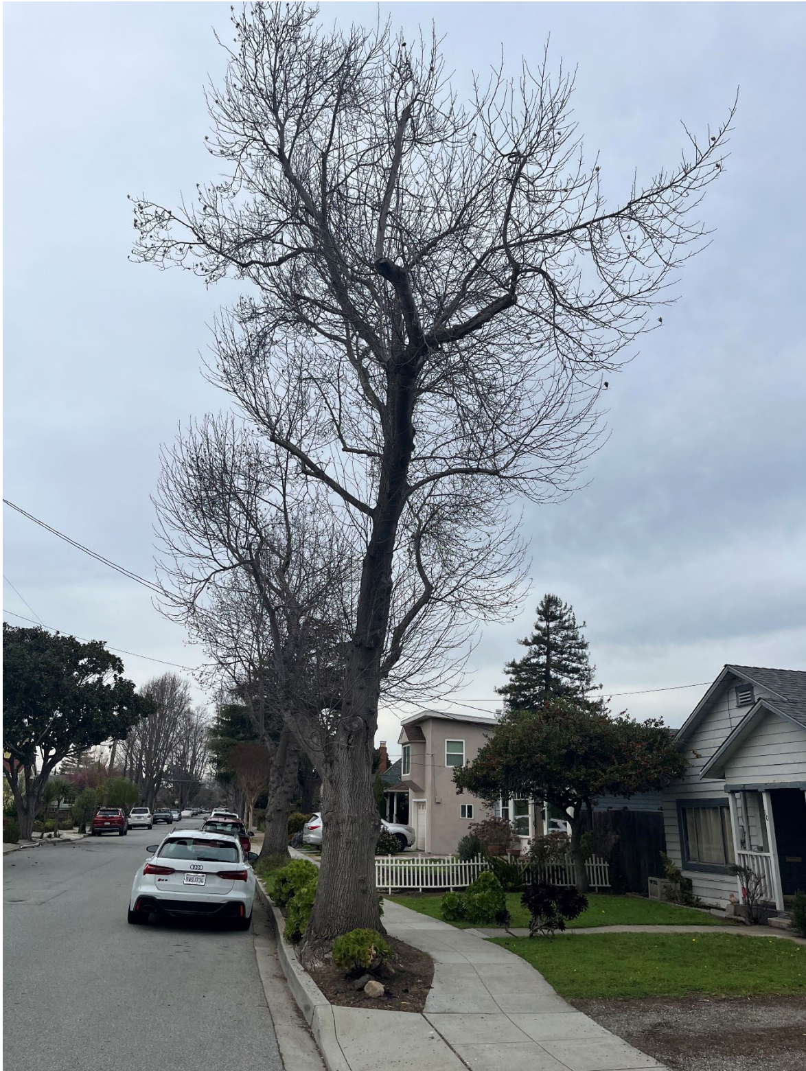
Tree # 4