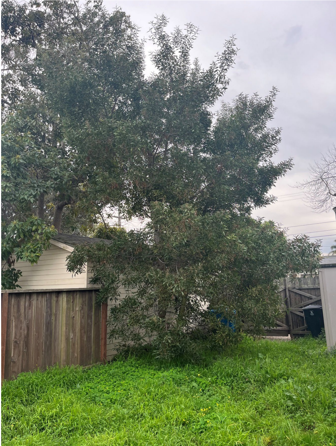
Tree # 2