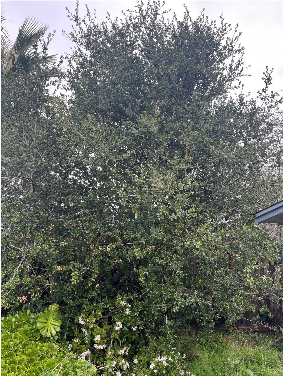
Tree # 1