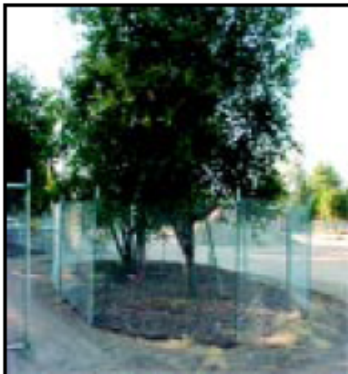
IMAGE 2.15-1 Tree Protection Fence at the Dripline

Any excavation within the TPZ shall be done with hand tools only. No roots greater than 2” in diameter shall be cut.