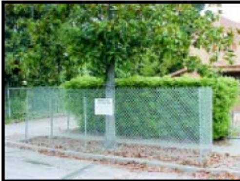
IMAGE 2.15-3 Tree Protection within a Planter Strip