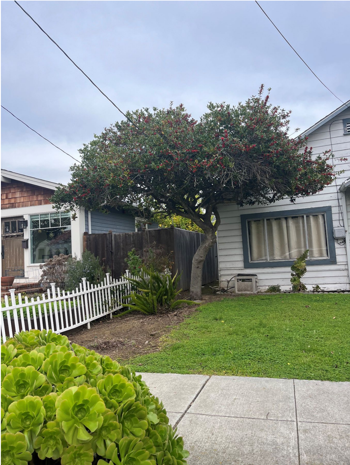
Tree # 3